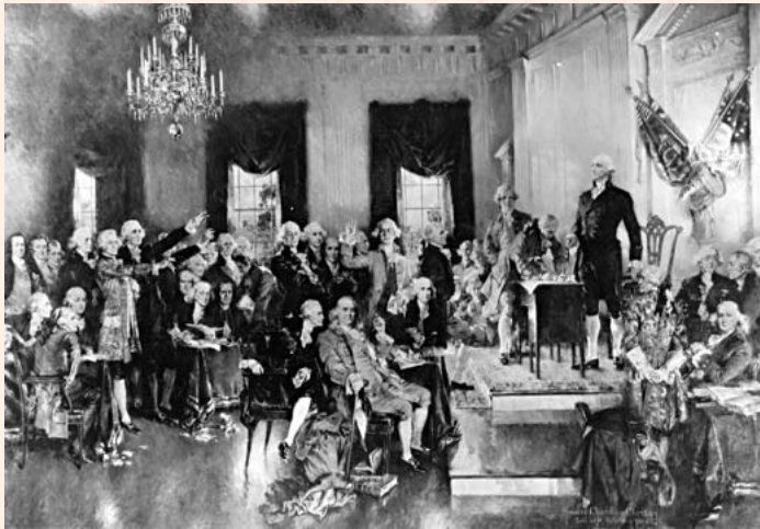
SCENE AT THE SIGNING OF THE CONSTITUTION OF THE UNITED STATES

“If you see oppression of the poor and denial of justice and righteousness in the province, do not be shocked at the sight, for one official watches over another official, and there are higher officials over them.”—Ecclesiastes 5:8